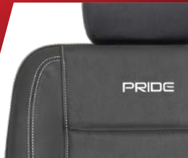
High-back memory foam seat